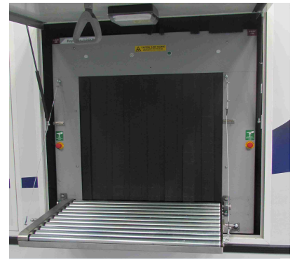
Tunnel Opening (width x height): 1,000 mm x 1,000 mm